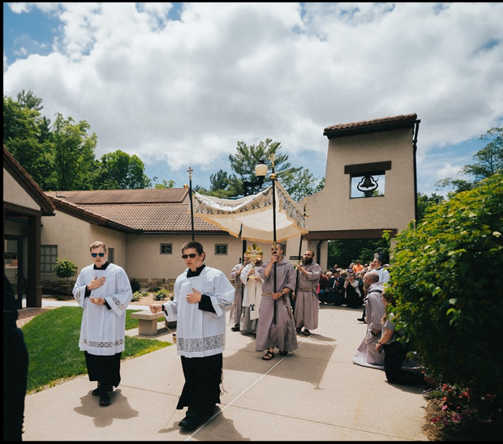
Eucharistic Procession continues at the Shrine of Our Lady of Guadalupe La Crosse, WI

Friday, June 7, 2024 Eucharistic Procession La Crosse, WI Eucharistic Revival 2022-2025