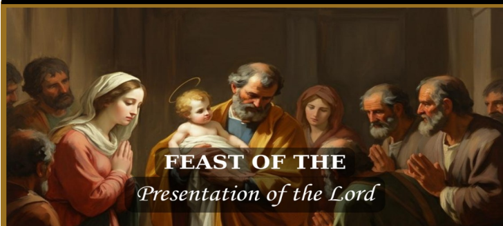
FEAST OF THE Presentation of the Lord

Diocesan Annual Appeal Goal ... $ 33,415.00 Amount Received ... $ 45,300.00 Amount Over ... $11,885.00 as of (1/13/26) Thank you!