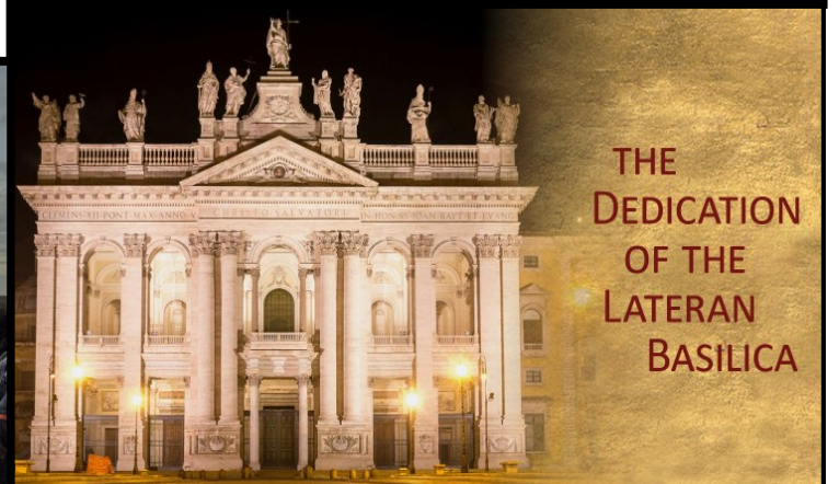
THE DEDICATION OF THE LATERAN BASILICA