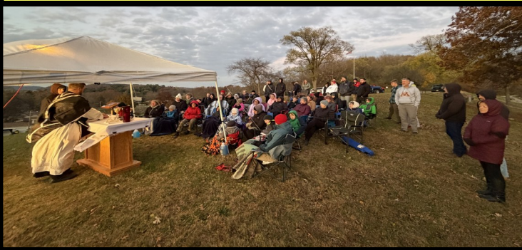
Mass at Cemetery On All Souls Day, Nov 2, 2025

It is with a sad heart that I share the our mission trip cannot happen next week. After seeing pictures and videos after the hurricane, our 27volunteers were even more motivated to get there and help in any way possible. With flights and hotel cancelled, this is not an option. The best we can do right now is to share awareness and ask for support. Please consider a donation to Mustard Seed Communities or Jamaican Mission Program. I can guarantee any funds to these charities will go directly to those in need. Message me for any details. You can also visit the Facebook pages for Mustard Seed Communities and the Jamaican Mission Program for up to date details on the status of any future travel and the condition of Blessed Assurance. brymyers@gmail.com www.jamaicanmissionprogram.com www.mustardseed.com Thank you and God Bless everybody in Jamaica, Bryan Myers