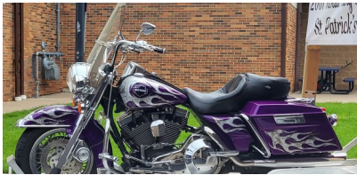
2001 Road King Harley Davidson

Drawing held 8/18/2024 Need not be present to win