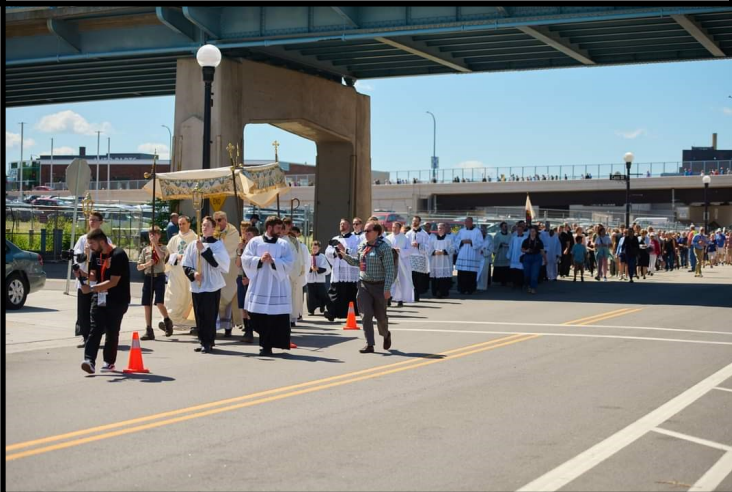
The Procession arriving in La Crosse, WI