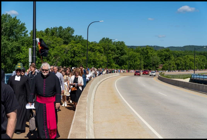
The beginning of the Eucharistic Procession