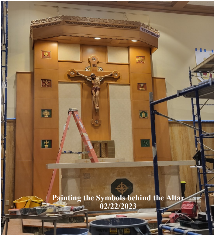
Painting the Symbols behind the Altar 02/22/2023