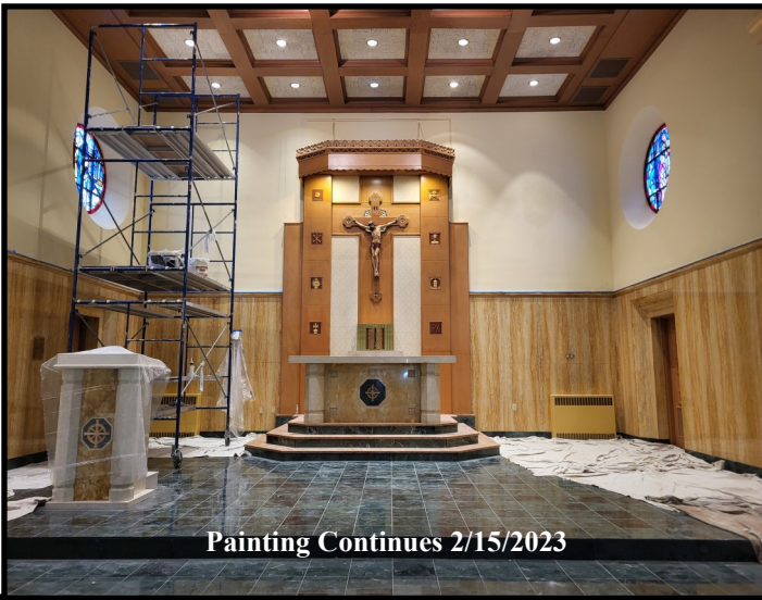
Painting Continues 2/15/2023