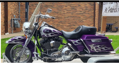
2001 Road King Harley Davidson

Drawing held 8/18/2024 Need not be present to win