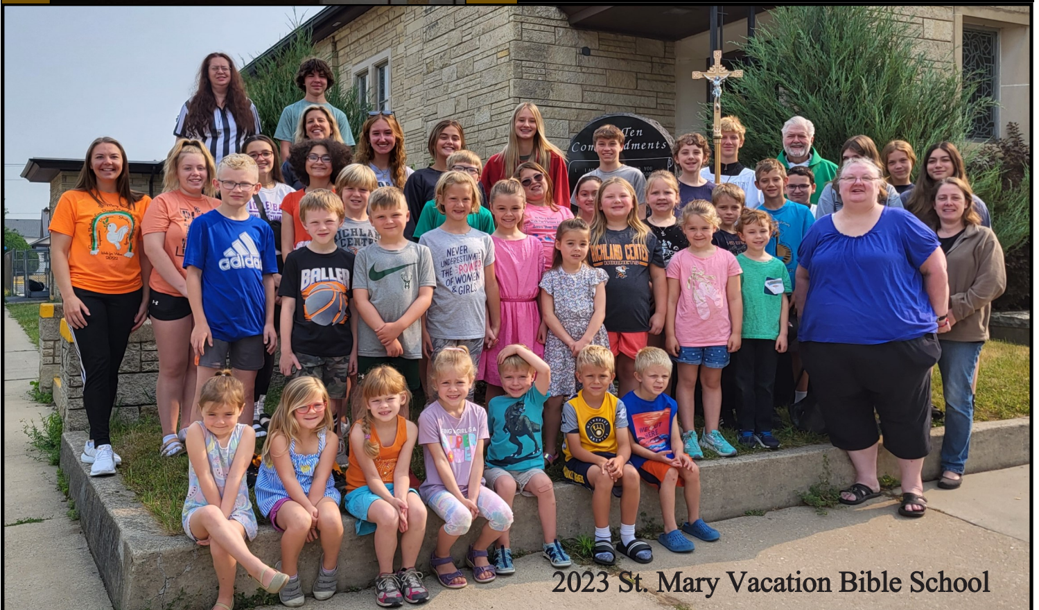
2023 St. Mary Vacation Bible School

Our Catholic Faith is the foundation and tradition of providing a quality, virtue-based education in a Christ-centered environment focused on excellence in academics, worship and service.