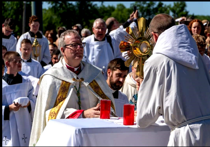
Bishop Robert Baron, Diocese of Winona-Rochester, Minnesota

Friday, June 7, 2024 Eucharistic Procession La Crosse, WI Eucharistic Revival 2022-2025